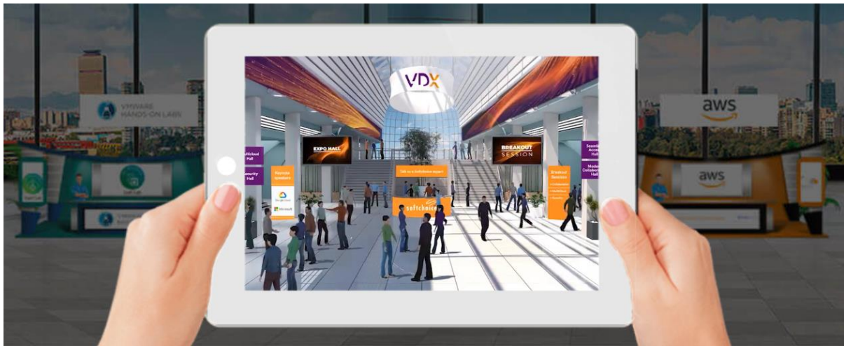
Figure 1: Lobby (Foreground) and Exhibition Hall (Background)

Information Desk which will be virtually manned by a member of the online platform's Project Management Team throughout the day.